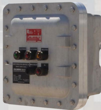
Ignition Control System

Radiation based upon customer requirements