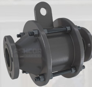
ASHCOR Flame Arresters